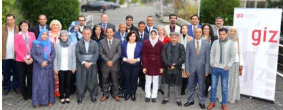
F2F meeting Bonn 11/2013