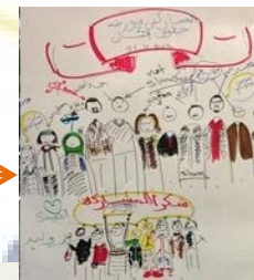
Virtual training 3/2014 – 3/2015