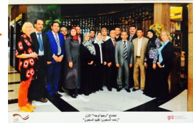
F2F Istanbul 10/2014