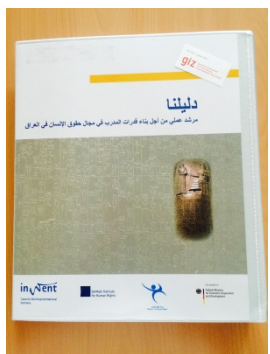
Iraq program HR 2005-2010